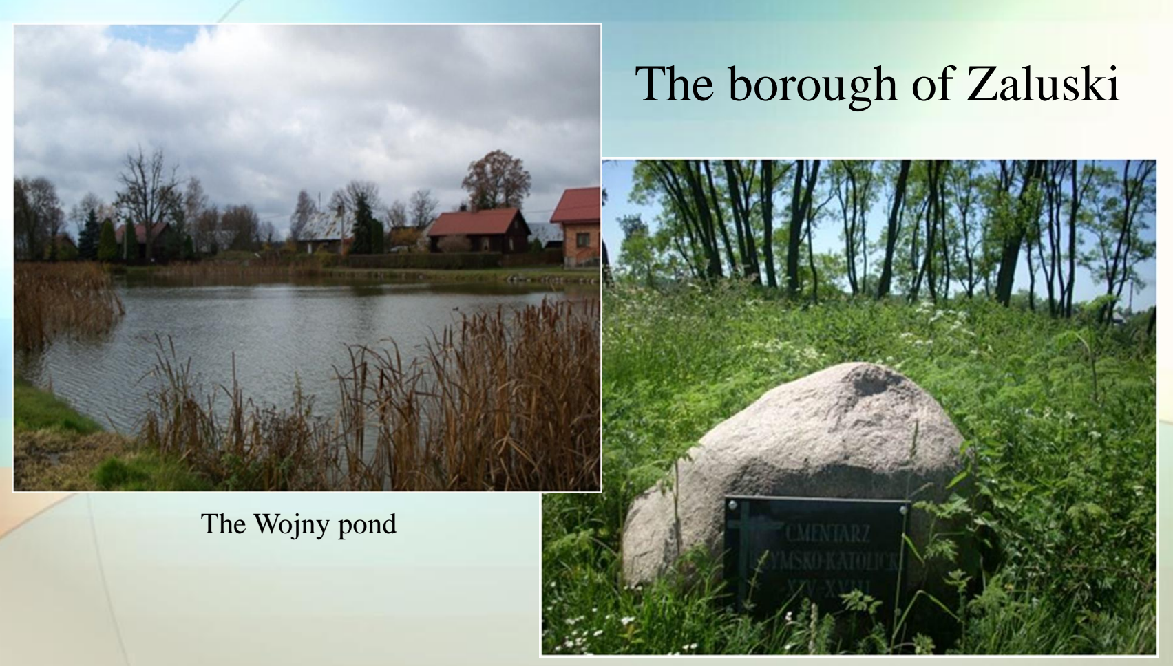
an old cemetery in Wronska

The borough's name comes from the ancestral name. Zaluski was the borough of the nobility, originally inhabited by the Zaluski family and then by Zaluscy. The area covers 112 km<sup>2</sup> and has a population of 5,700 people.