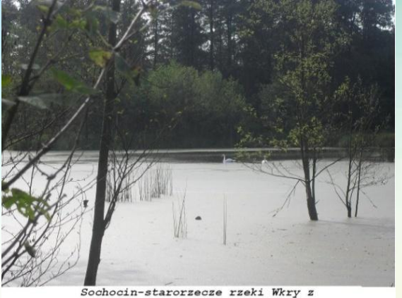
Sochocin-starorzecze rzeki Wkry z pływającymi łabędziami, z bogatą szatą roślinną.