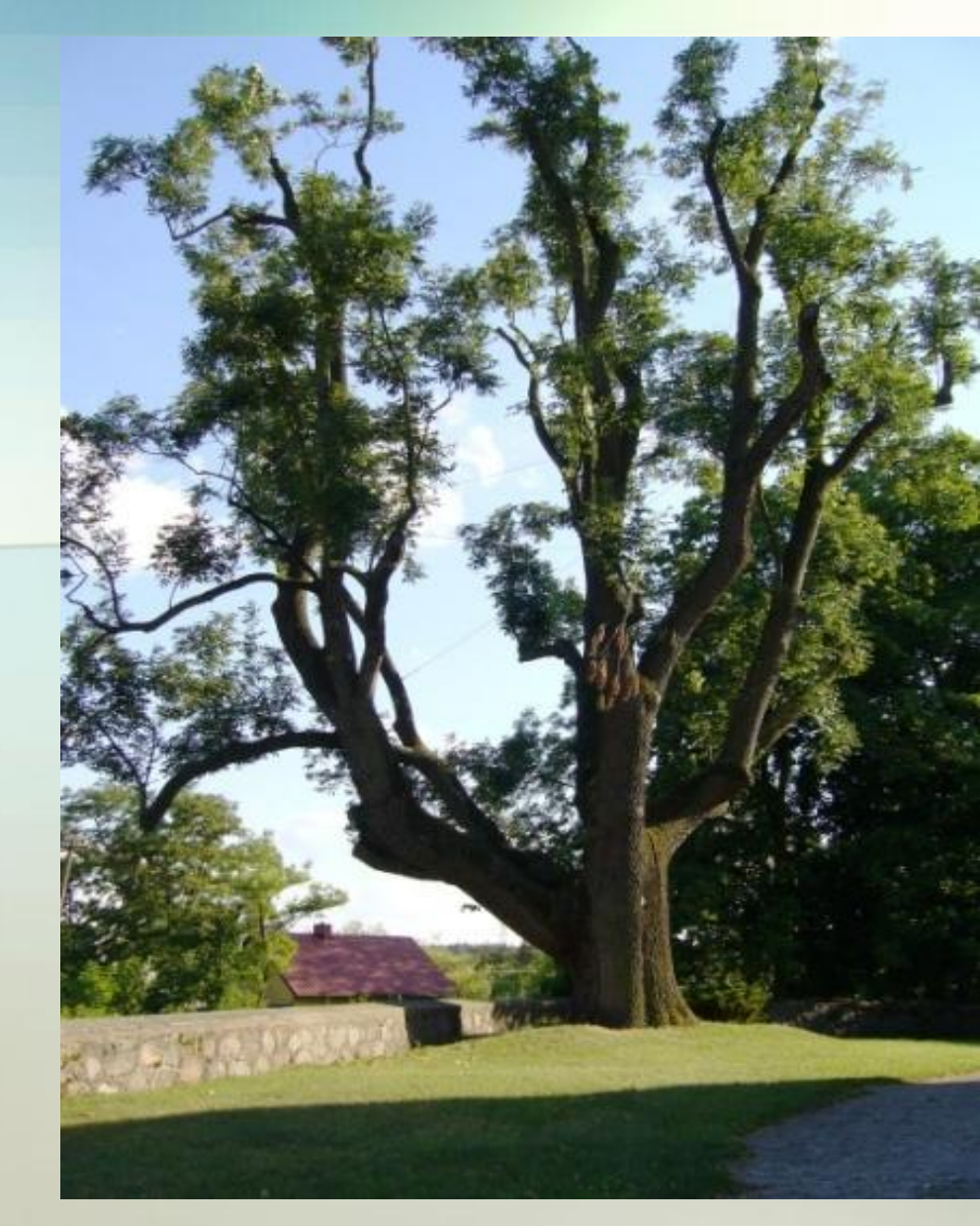
A massive ash-tree in Krysk nicknamed the Giant