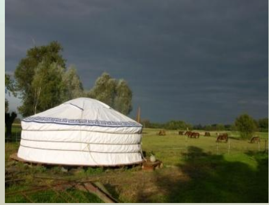
Hutsul Farm before a thunderstorm