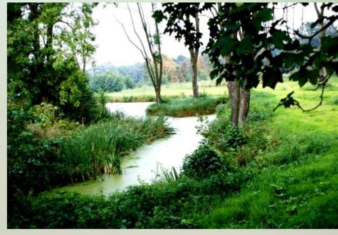
Meanders of the Naruszewka